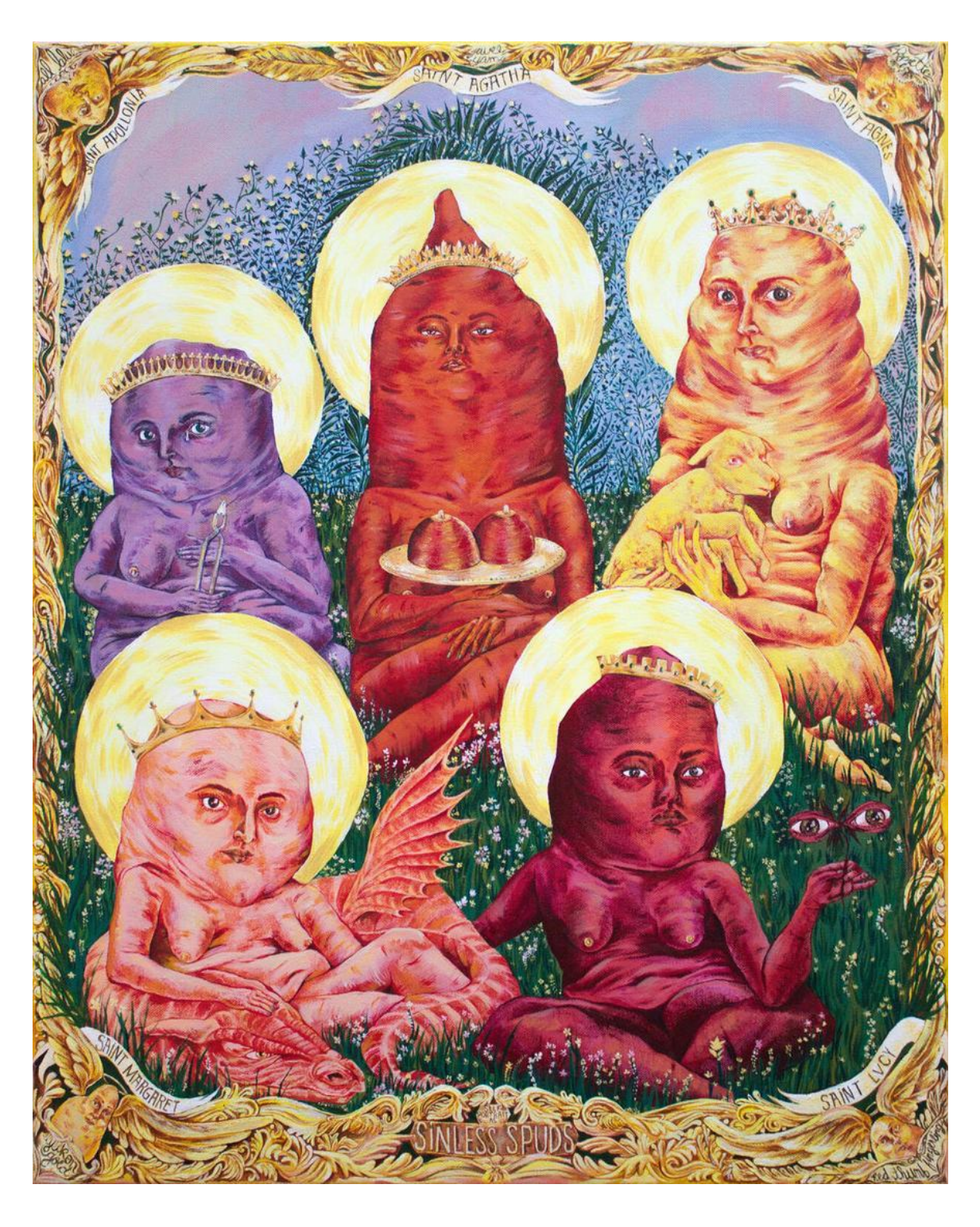
Sinless Spuds, 2019. Rosabel Rosalind.